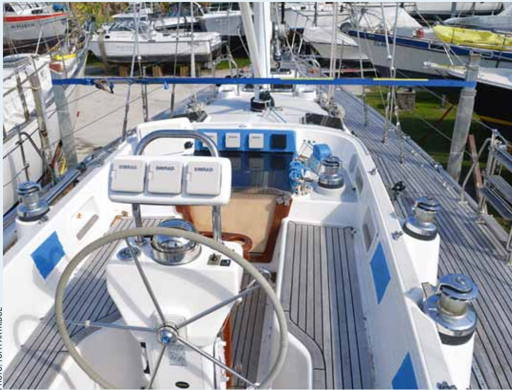
A safe option is a strong cradle with arms secured by chains, the hull supported with 'acro props' and ratchet cargo straps fore and aft, port and starboard, to secure the boat to the cradle