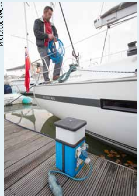
Charge batteries, fill tanks, then unplug shore power, lock up and get off the boat