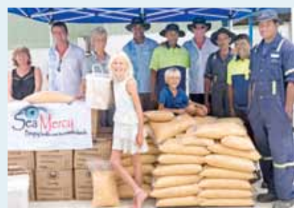
Organisations like Sea Mercy coordinate private skippers to distribute aid by yacht

For more information or to donate, go to: www.yachtingmonthly.com/vanuatucyclone