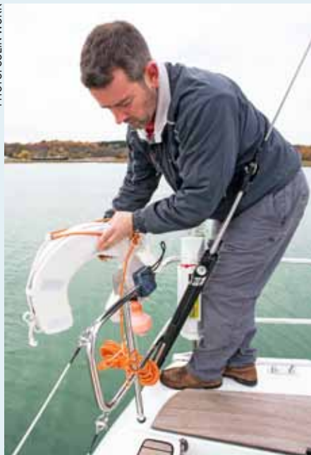
Remove as much windage as you can, up to and including the mast if possible