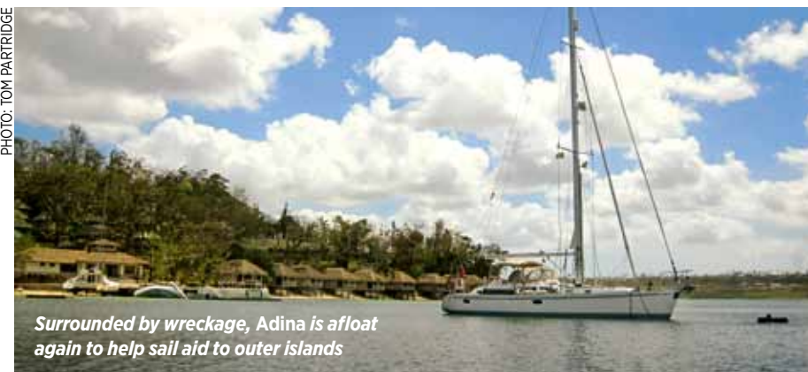
Surrounded by wreckage, Adina is afloat again to help sail aid to outer islands