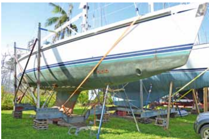
Chains, props and cargo straps meant Adina survived unscathed

These islands will recover. Lessons will be learned. New rules will be implemented, and next time they will be better prepared, whether ashore or afloat. It's still a wonderful place to sail, and Vanuatu deserves its place on the list of 'must-see' Pacific destinations. Blue water cruisers love adventure and it abounds in these beautiful islands.