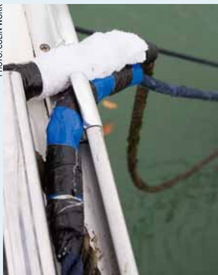
Use your heaviest mooring lines and protect them at any potential chafe points