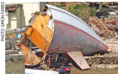
Many wreck owners salvaged what they could then left their boats to the chainsaw

Life here is still largely self-sufficient and villagers take their produce miles to big markets to sell. Now there are no crops, no food, no money and fresh water tanks were destroyed. For now, they need our support.