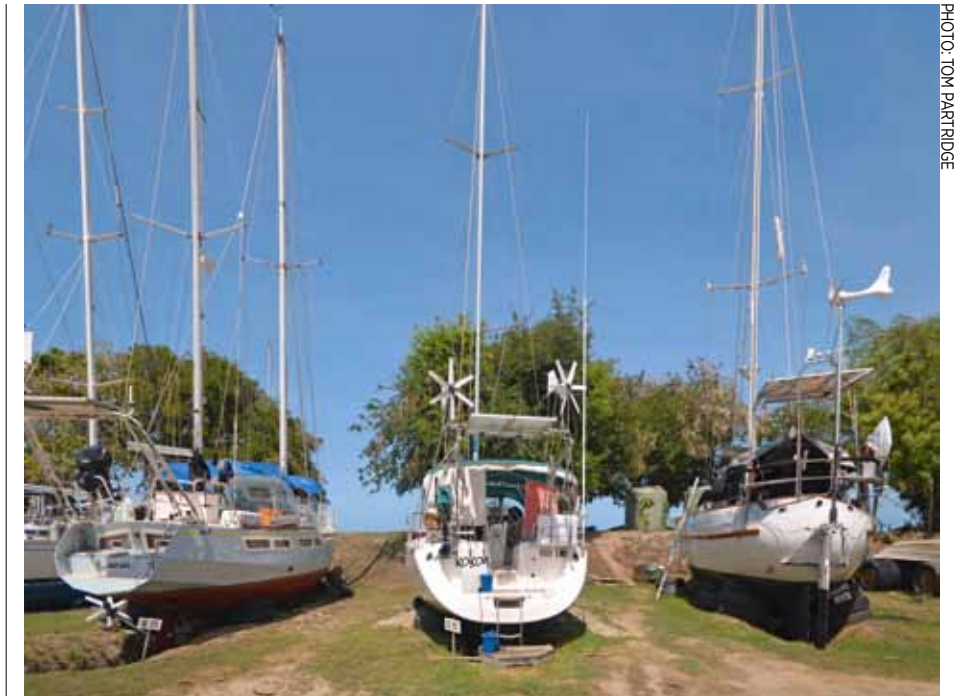
The manager of Vuda Marina, Fiji, says digging in the keel is the best way to ride out high winds