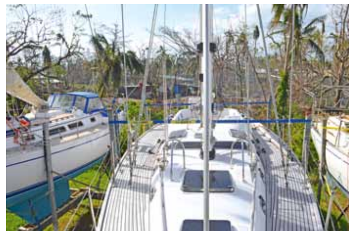
Biminis, sails, halyards, solar panels - all removed to reduce windage