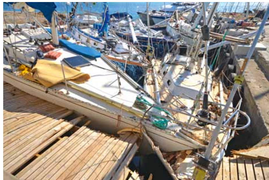
An iconic image of boats wrecked in the 'Boat graveyard' by the power of Cyclone Pam

Cyclone Pam ripped through the islands of Vanuatu in March 2015, causing almost unprecedented devastation. She was classified as Category 5: with maximum mean wind speeds over 108 knots. Port Vila recorded wind speeds of 116 knots gusting to 185 knots between 2200 on Friday 13th and 0200 on Saturday 14th as the eye passed to the east, with winds tracking from southeast to southwest. Vanuatu may be on the